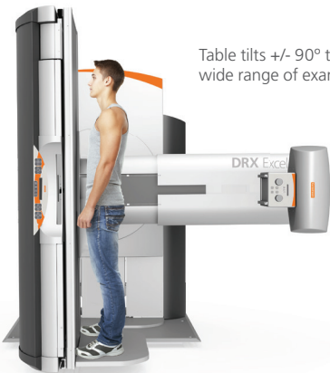
Table tilts +/- 90° to accommodate a wide range of exam types.

The DRX-Excel Plus offers an advanced, remote-controlled table with exceptional flexibility for a wide range of applications. Its ergonomics and efficiency optimize the entire examination process – with convenience for the operator and a low-stress, comfortable experience for the patient.