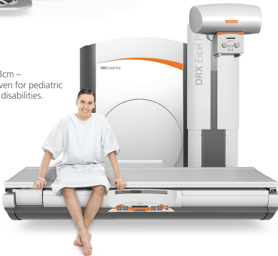
Table lowers to 48cm – easily accessible even for pediatric and patients with disabilities.