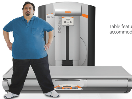
Table features a 265kg weight capacity to accommodate heavier patients.