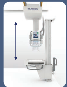
▶ SID track to wall stand