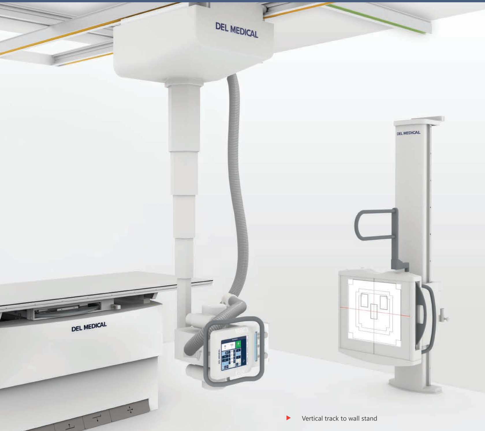
▶ Vertical track to wall stand