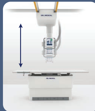
▶ SID track to table

Synchronized motorized movement of the tube crane's vertical axis maintains precise centering between the X-ray tube and image receptor. Available functions include vertical tracking to the wall stand, SID tracking to the elevating table, or horizontally positioned wall stand. The result is quick, accurate alignment without the extra time and effort needed to make additional manual adjustments.