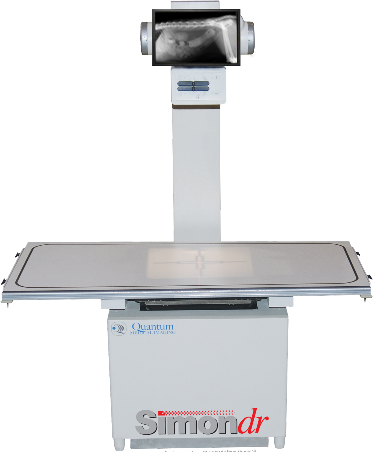
Preview monitor is an upgrade from SimonDR